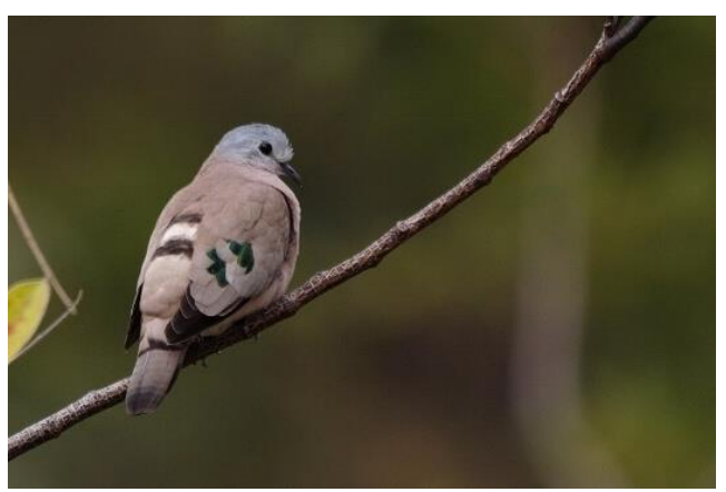
Emerald-spotted Wood-dove.

we visited, about six White-backed Vultures were preening and drinking, while a flock of Yellow-billed Oxpeckers took to the air as we arrived. A pair of Grey Go-away-birds in the vicinity was unsettled, calling in their usual way to inform game animals of approaching strangers.