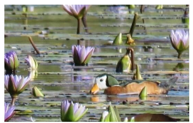
African Pygmy-goose.

On 6<sup>th</sup> April, Sigrid Stone and I were fortunate enough to have sufficient fuel to head out to Mandalay Dam, situated between Eiffel Flats and Kadoma. It didn't take long for us to find African Purple Swamphens, which delighted us, five of them, gleaming in the early morning sun! We were so fortunate to be able to observe these shy, elusive birds foraging in the shallows and moving among the bulrushes and sedges growing on the dam periphery.