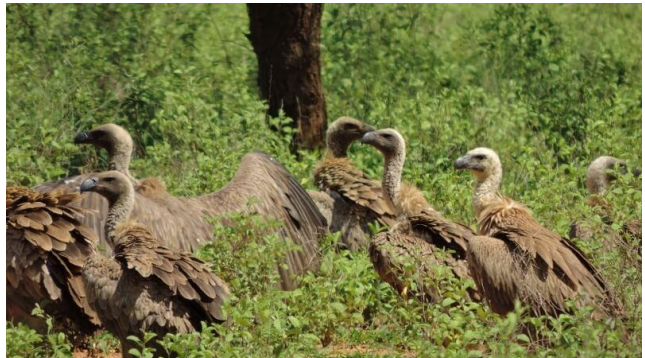
White-backed Vultures (above) at a kill at Sango and Violet-backed Starling (below) in January 2018.

at one of the artificial pans that we visited. Southern Yellow-billed Hornbills and Meves's Starlings kept us company and we continually saw them all the way.