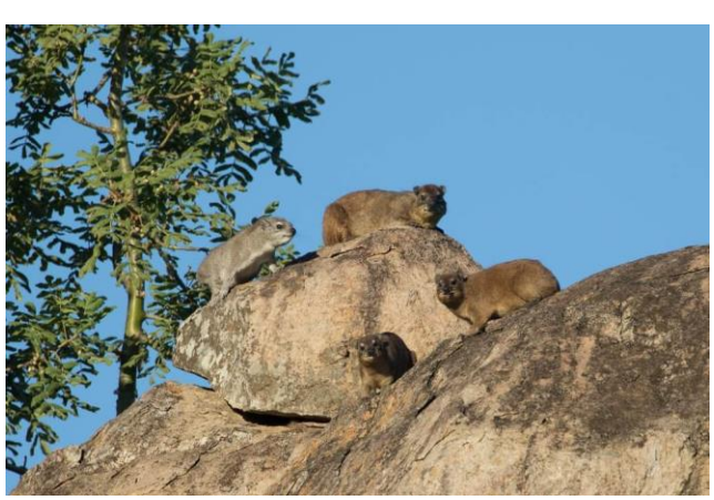
Hyrax enjoying the sun.

Not many people will know that 2019 is the 56th anniversary of the inception of the Verreaux's Eagle Survey in the Matobo Hills, a breeding survey, which is the longest running survey of its kind anywhere in the world. The Matabeleland Branch of BLZ has kept it running through thick and thin and their teams, as well as doing nest checks during the season, also conduct an annual dassie count. While a dassie count has been done for many years, the branch only took over this task some 13 years ago and it was decided then that the count be conducted annually towards the end of May. Hyrax is the main prey base for the Verreaux's Eagle in the Matobo Hills providing 99% of their preferred diet. While the dassies, Yellow-spotted (Heterohyrax brucei) and Rock (Procavia capensis), appear to be thriving within the park, both in the recreational side and the Whovi, which is the game park, sadly, there is very little evidence of many, if any, animals in the adjoining communal areas. Animals have been trapped for karosses, tourist gimmicks and food. Thus, all the historical nests in those affected areas are There has been evidence of now derelict. snaring within the park too, which is of grave concern.