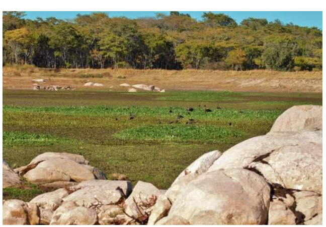
Spur-winged Goose and Glossy Ibis on the lower dam

through the adjacent patch of woodland, also very quiet, to join another splinter group on the west side of the lower dam. Here we looked over the expanse of water plants at a number of Spur-winged Goose, a nice flock of Glossy Ibis, with the more typical Egyptian Goose, Blacksmith Lapwings, African Jacana and others. In the middle ground, on a jumble of stranded granite boulders, Debbie pointed out a large water monitor. Across the way, on the wall, the others ticked Senegal Coucal, various swallows and Brown-throated Martin, Orangebreasted Waxbills and more. Making our way across the upper reaches of the dam (a shortcut for the adventurous provided by an Indiana Jones-type fallen tree bridge) to the east side, I joined the others where a large flock of LBJs making incursions from a Lantana thicket to the bare ground below proved to be mostly Pintailed Whydahs.