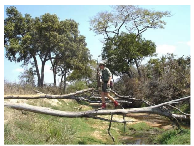
Tree bridge navigation - another place & time...

Some of us headed towards the east fence and some gums from where African Fish-eagle called and had a sighting of a Copper Sunbird in a thicket of bushes. On the grassy field a lonely Bontebok eyed us warily and I had a flashsighting of an African Fish-eagle disappearing into the middle of a large gum, pursued by Pied Crows - we later spotted a large nest deep in the tree. Circling around to the northeast patch of woodland there were a few more birds to add like Brubru, Red-winged Starling, African Yellow White-eye and Miombo Double-collared Sunbird, but a large gravel pit has been opened in this area. With the low water levels it was easy to take a shortcut to the houses via the top of the upper dam and of interest was not one but two melanistic Gabar Goshawks flying into the gardens. Here some of the residents regaled me with their difficult 1+hr task of identifying a