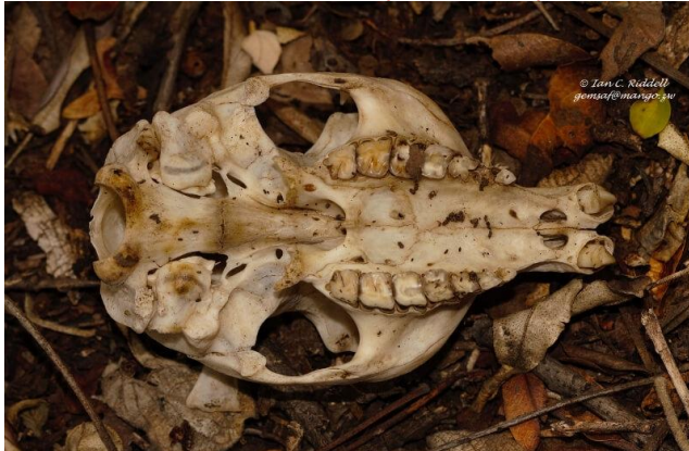
To some degree, the shape of the rostrum and other small skull formation differences separate Procavia capensis . Particularly premolar 1, which is often missing in capensis (lower jaw); overall length of premolars 1-4 which are the same as length of molars 1-3, are other differences

So... by six o'clock in the evening of Friday 24<sup>th</sup> May, twelve 'black eaglers' had arrived at Rowallan Park, Matopos, to set up camp for two