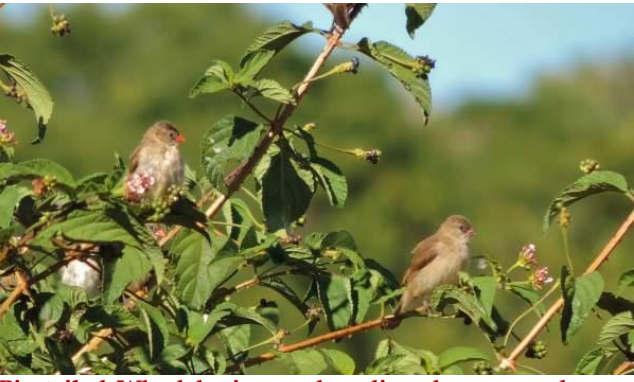
Pin-tailed Whydahs in non-breeding dress caused some identification errors, being confused for widowfinches and Southern Grey-headed Sparrows