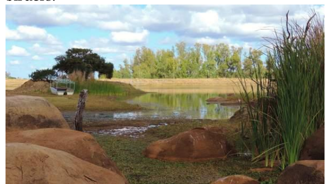
The top dam at a low level. With the headwaters of these dams being developed the future water supply is under threat!

Black-collared Barbet that had earlier collided with a window – you guessed it, they weren't birders!