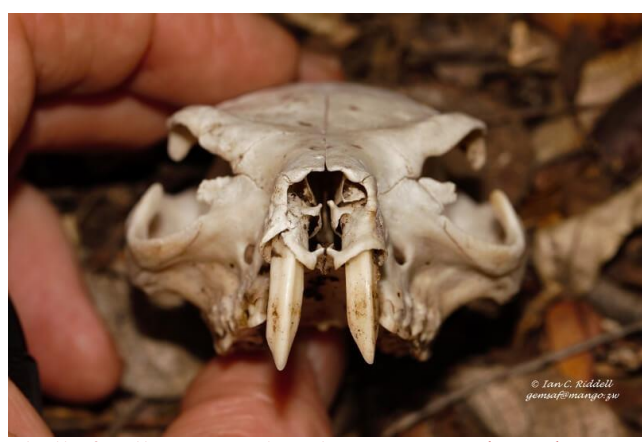
Skull of Yellow-spotted Rock Hyrax Heterohyrax brucei

A question often asked is "How on earth do you count them?" Watching carefully, the older animals emerge first to warm up, followed by the sub-adults, then the juveniles and lastly the pups will emerge. It is, usually, all very orderly! Most dassies sit to warm up for a while but as the day warms, the animals will start to disperse to feed so it's time to pack up.