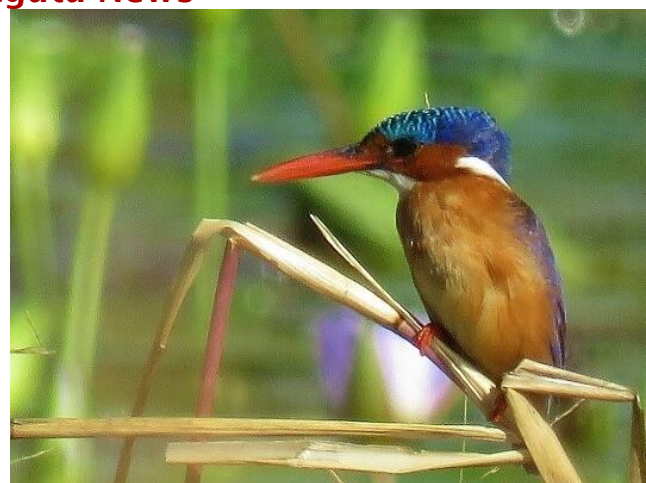
Malachite Kingfisher.

Mandalay certainly proved to be full of surprises - we were entertained by a busy Black Heron (doing its umbrella dance!) whilst colourful European Bee-eaters soared overhead. Red-billed Teal, Comb Duck, White-faced Duck and White-backed Ducks, along with several Pygmy-goose, pairs African themselves among the vast expanse of water lilies. We were pleased to see a pair of Redknobbed Coot moving sedately through the lily leaves and flowers, and several Black Crakes that dashed in and out of the bulrush fringe. Three energetic Pied Kingfishers were hovering and diving for fish whilst a lone Malachite Kingfisher waited patiently for its prey on a dried grass stalk. Two Hamerkops flew up from the shallows. Upon reaching the eastern side of the dam, we spied a well-camouflaged Squacco Heron and a shy Purple Heron, which were happily added to our list. Minutes before our departure, we were very fortunate to see a magnificent Black-chested Snake-eagle swoop down and catch a small snake on the water's edge.